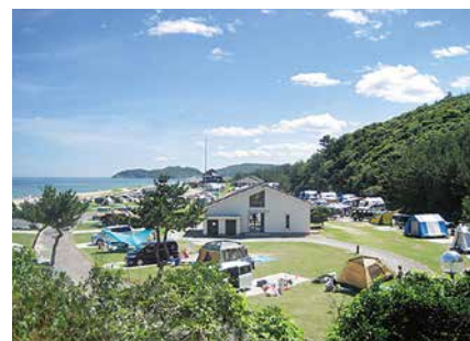
Iwami Seaside Park 石見海浜公園 [Iwami Kaihin Koen]

This area is a nationally designated natural monument. After passing through a chilly, and supposedly haunted, cave, you exit onto a picturesque stretch of beach where you can explore mysterious rock and shell fossil formations created by wave erosion over 160 million years ago.