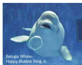
Beluga Whale- Happy Bubble Ring®